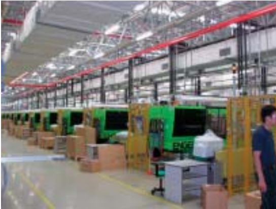
Overhead air conditioning ductwork in a factory.