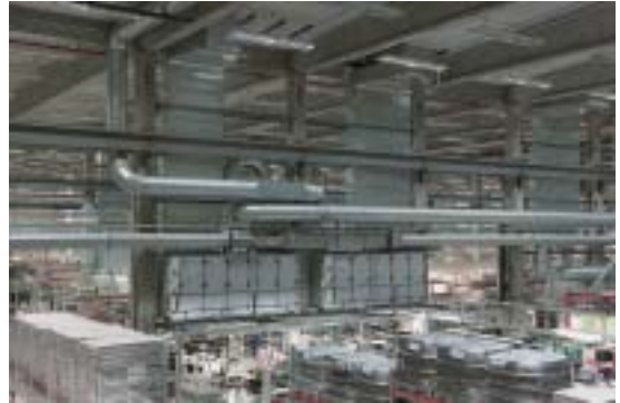
Air handling units (AHUs) and the duct work in a factory.