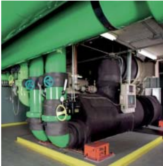
A chiller unit (One America Plaza, San Diego, CA, USA).