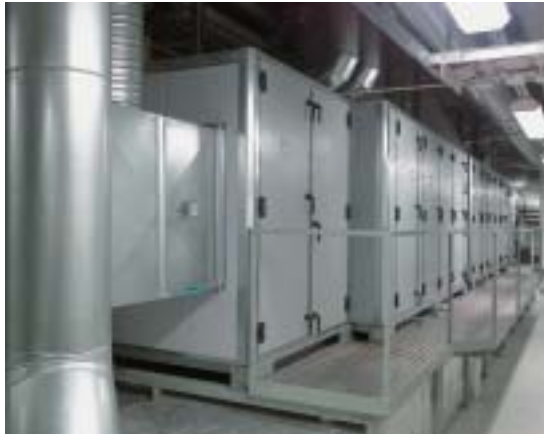
Air handling units (AHUs) of an office building.